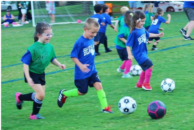
As soon as we could, sports were again an active part of the life of this community.

We had planned to increase the size of our Pre-k and daycare, which we did, but additionally, federal grants, applicable to daycare programs greatly impacted in a positive way.