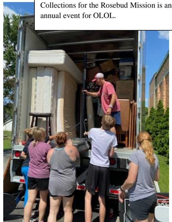
Collections for the Rosebud Mission is an annual event for OLOL.